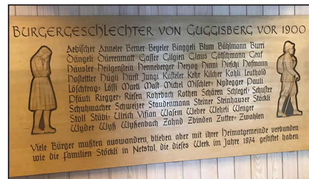
Government Office at Guggisberg with Mast and other surnames who originate there.