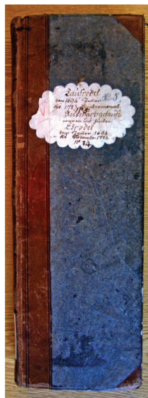
Guggisberg Baptismal Record Book housed in Bern Stadtarchiv.